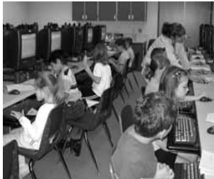
Measure C provided funds for technology upgrades at all of Folsom's older schools.

students state-of-the-art technology and modern classroom equipment. The schools have upgraded infrastructure, including, in some cases, new heating, ventilation and air conditioning systems, improved wiring for technology and roof repairs.