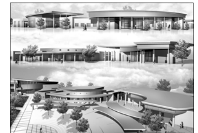
Measure C is funding the construction of Vista del Lago High School, which will open August 2007.

DID YOU KNOW? Vista del Lago High School will keep its new students and teachers cool and provide them a well-lit environment through energy efficient design elements that will save the Folsom Cordova Unified School District (FCUSD) $56,880 annually.